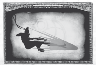
Push the left stick towards an enemy twice and press 3 / Press 3 , then push the left stick (once) and press 3

Slide heel first up to an enemy from long distances.